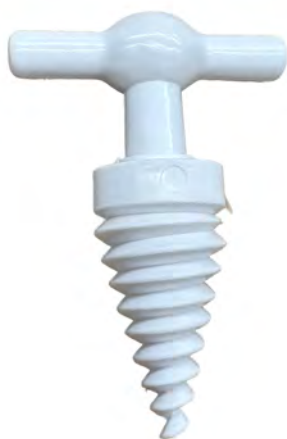
Plastic Screw Driver.

PRODUCT CODE 300001447 TEETH SCREW DRIVER